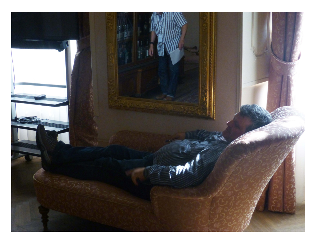
Figure 48. Princely Lounge, MatTriad conference in Liblice, Czech Republic, 8-13 September 2019.