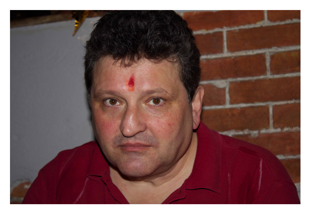
\textbf{Figure 34.} \ \, \text{Kolkata, 31 December 2012. After visiting a temple.}