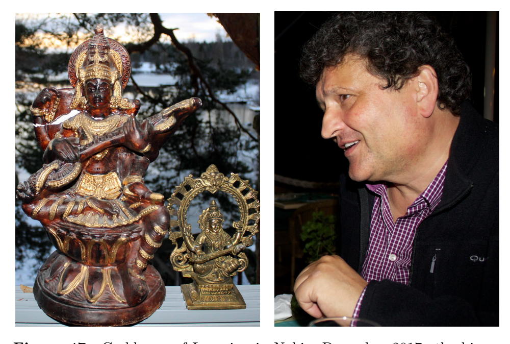
Figure 47. Goddesses of Learning in Nokia, December 2017: the bigger one from Tirunelveli in Dec 1993, the smaller one from Manipal in Dec 2017. Augustyn in Montenegro, 17 September 2017.