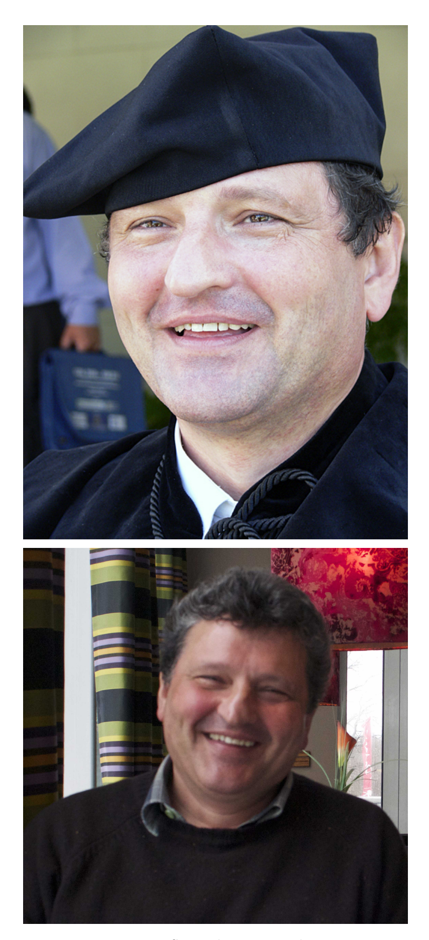
Figure 53. Tomar, September 2006; Nokia, May 2013.