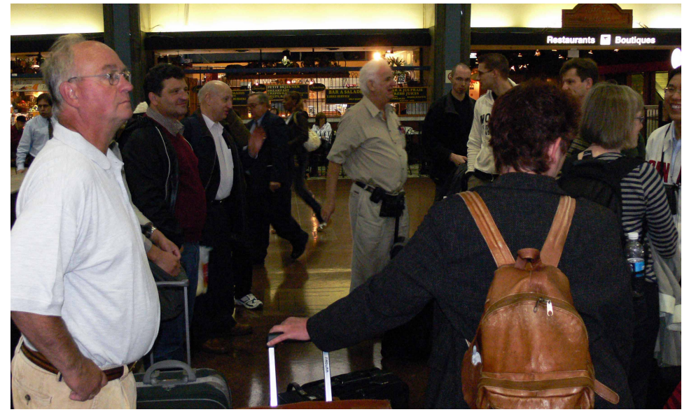
Figure 17. Above: McGill\ Matrix\ Wednesday , Montréal, 20 May 2007. Below: waiting for the train Montréal–Windsor, 31 May 2007.