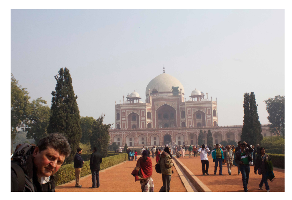
Figure 36. Taj Mahal, 6 January 2013.