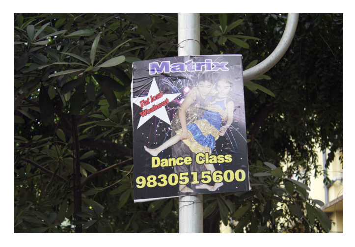
Figure 32. Dancing, matrix ! How to dance the matrix ? Ever done that? Kolkata, 29 December 2012.