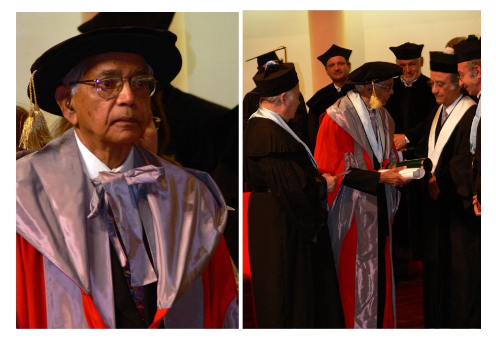
Figure 15. International Conference on Interdisciplinary Mathematical and Statistical Techniques, Tomar, Portugal, 1–4 September 2006. C.R. Rao received an Honorary PhD. Can you spot Augustyn?