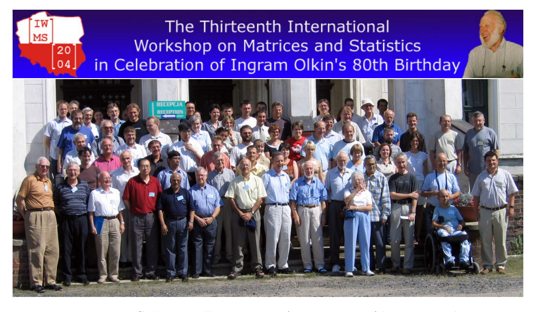
Figure 10. IWMS #13, Będlewo, 18–21 August 2004. Abstract Book.