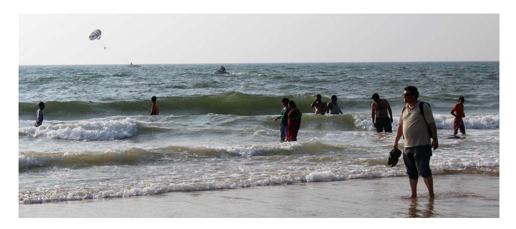
Figure 24. Goa, 3 January 2012.