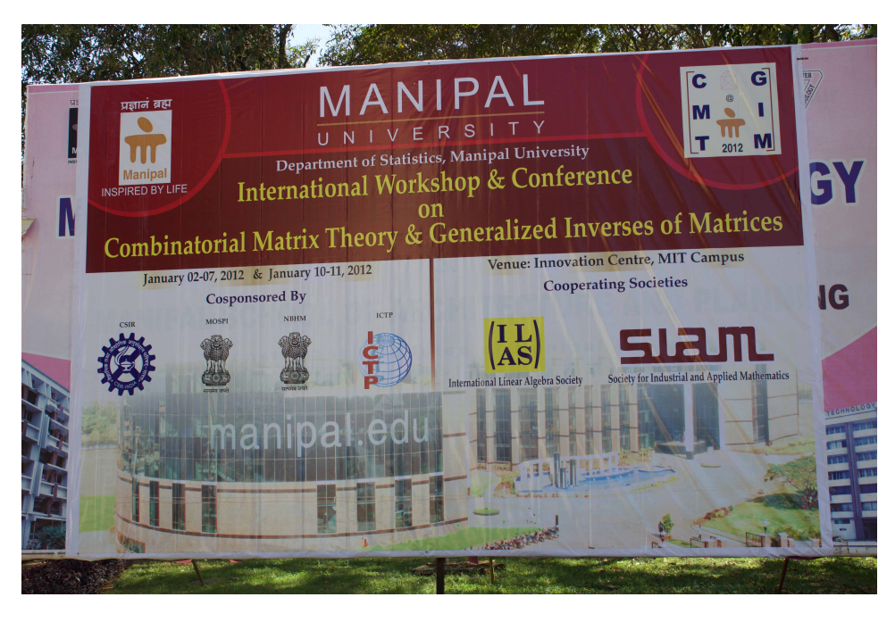
Figure 22. International Workshop & Conference on Combinatorial Matrix Theory and Generalized Inverses of Matrices, Manipal University, Manipal, India, 2-7 & 10-11 January 2012.