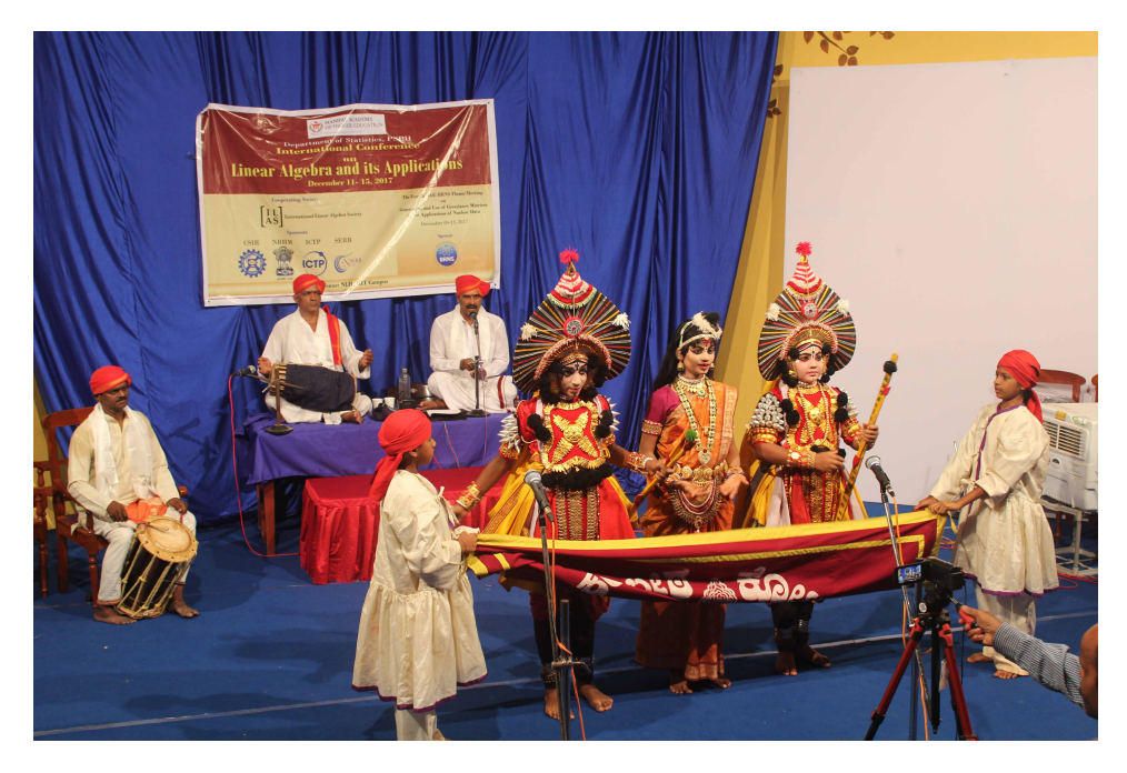
Figure 45. Cultural event, Karanth Bhavan, Kota, 13 December 2017.