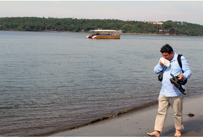
Figure 40. 1 December 2017, Panaji, Goa.