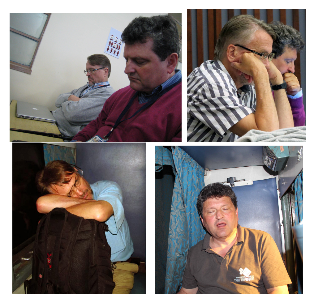
Figure 28. Above: Kolkata 27 December 2012; Toronto, August 2013. Below: Manipal–Kochi train 12 January 2012, 11:56–22:25.