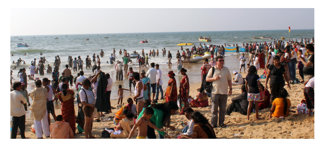
Figure 1. A Pole on a Goan Beach, 3 January 2012.