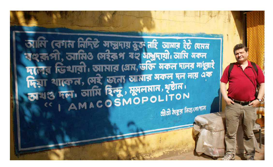
Figure 2. That's it. Kolkata, 31 December 2012.