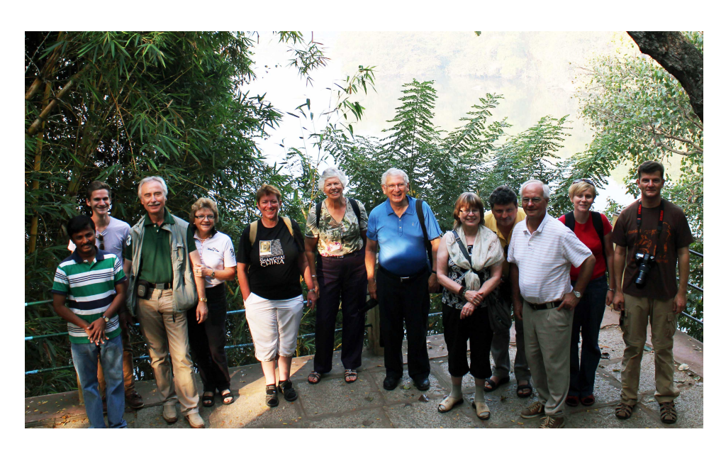
Figure 26. Ranganathittu Bird Sanctuary, Karnataka, India, 9 January 2012. Excursion arranged by Prasad when attending the International Workshop & Conference in Manipal.