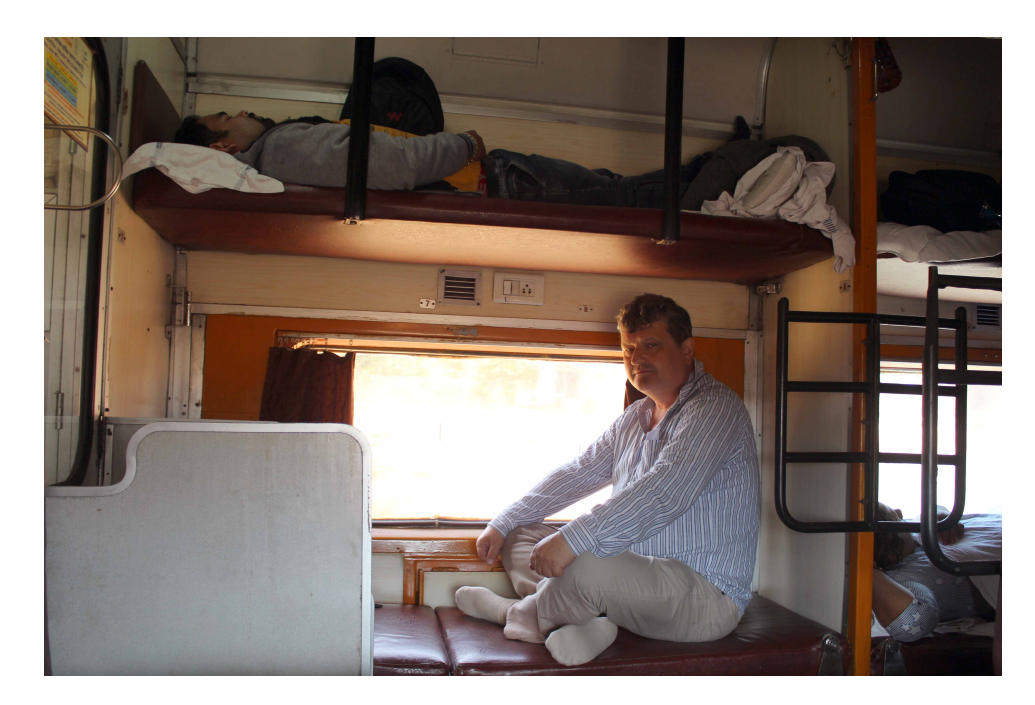
Figure 41. Horizontal travelling, 4 December 2017. Goa-Mangalore train # Mangalore Exp-12133, 5h26, Coach AB1, seat/berth LB/4, LB/1, SL/7; Class: 3A.