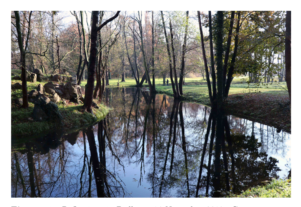
\bf Figure~50. Reflections in Będlewo, 14 November 2019. Can you spot a human being?