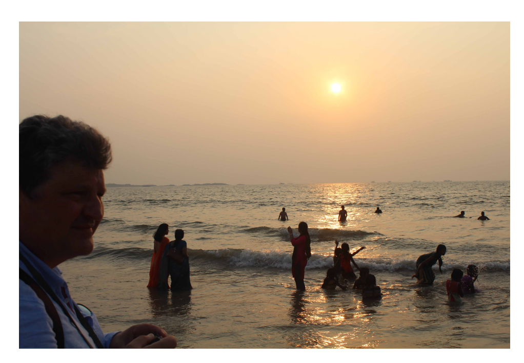
Figure 46. Sunset in Manipal, 16 December 2017.